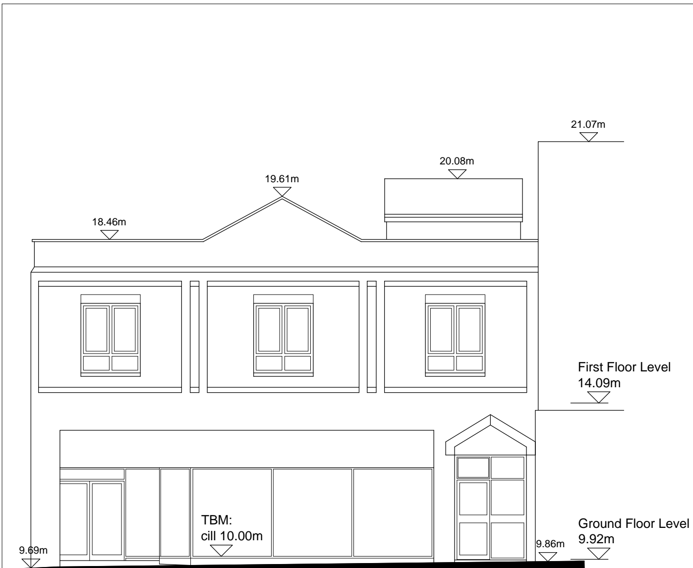
Existing Elevation 1 Datum: 8.00m